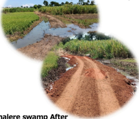
Namalere swamp After