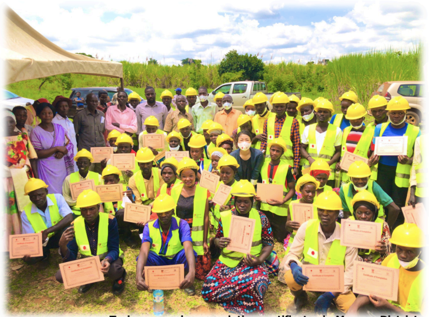
Trainees receive completion certificates in Mayuge District