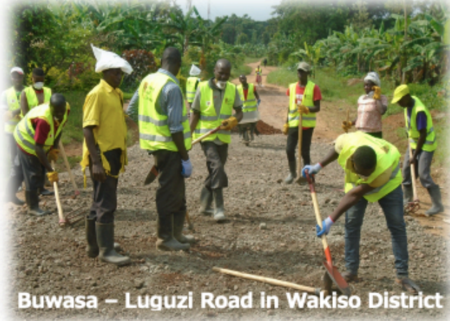
Buwasa – Luguzi Road in Wakiso District