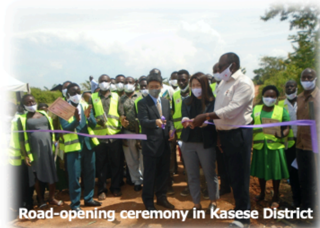
Road-opening ceremony in Kasese District

We repaired 603m of CARs using Do-nou technology and trained 160 community members to be “self-reliant”.